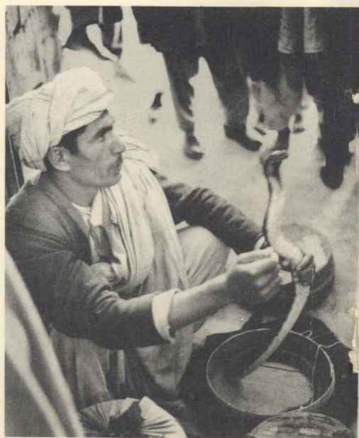
Fig. 1.3. A šowqi activity: snake handling in Xanabad