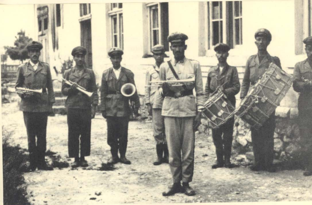
Fig. 1.5. Maimana municipal band