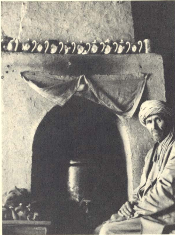
Fig. 1.6 Teahouse in Samangan

the North and more particularly to Turkestan and Katağan. It is principally the two stringed instruments, the dambura and ğičak , that symbolize in material terms the spread of the northern teahouse style; we shall return later in this chapter to the ethnic significance of the instruments.