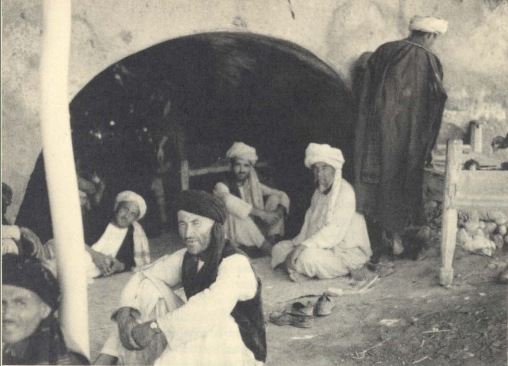
Fig. 1.4 Improved outdoor teahouse under Tašqurğan River bridge during 1972 drought

development of their repertoire; important to note here are their extensive travels and the eclectic nature of the music they play, which embraces the major ethnic and regional musical strains. The widest-ranging tour I know of was that of Bāz Gul Badaxši in 1968; his home town is Kešm, westernmost city of Badaxšan, and I had accounts of him from as far away as Saripul in south-central Turkestan, seven bus or truck stops removed from Kešm. These wandering minstrels cross-pollinate the musical environment, keeping whole species of music alive, and are thus an integral component of the shared music culture of the North.