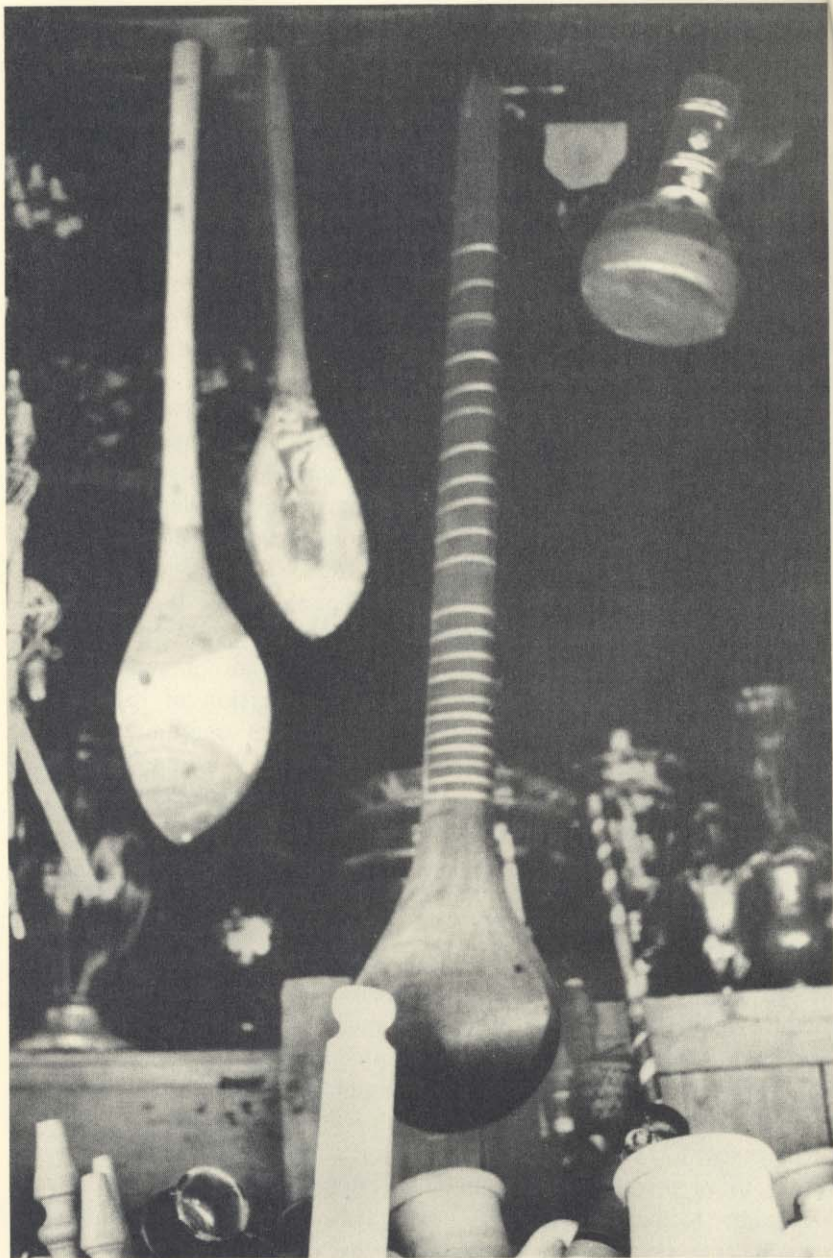
Fig. 1.7. Musical instruments in a shop in Xanabad, a crossroads region (left to right: Turkestani dambura, Badaxšani dambura, tanbur, zirbağali)