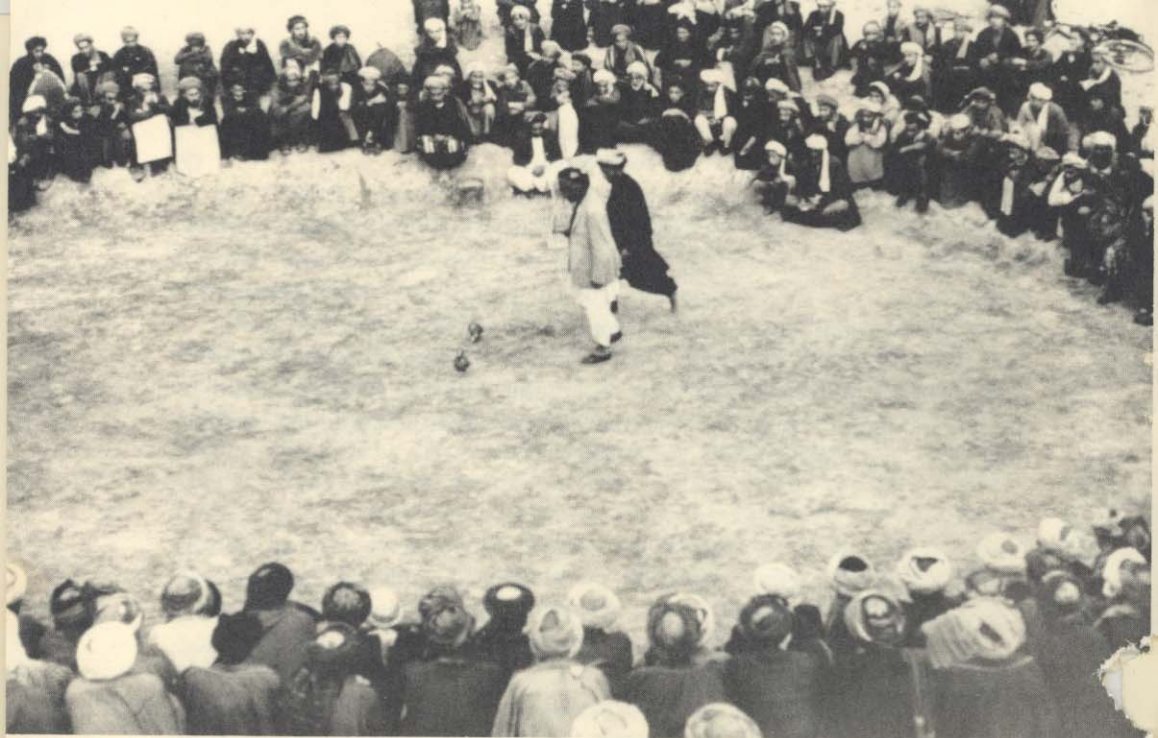
Fig. 1.1. A šowqi activity: partridge fighting in Tašqurğan